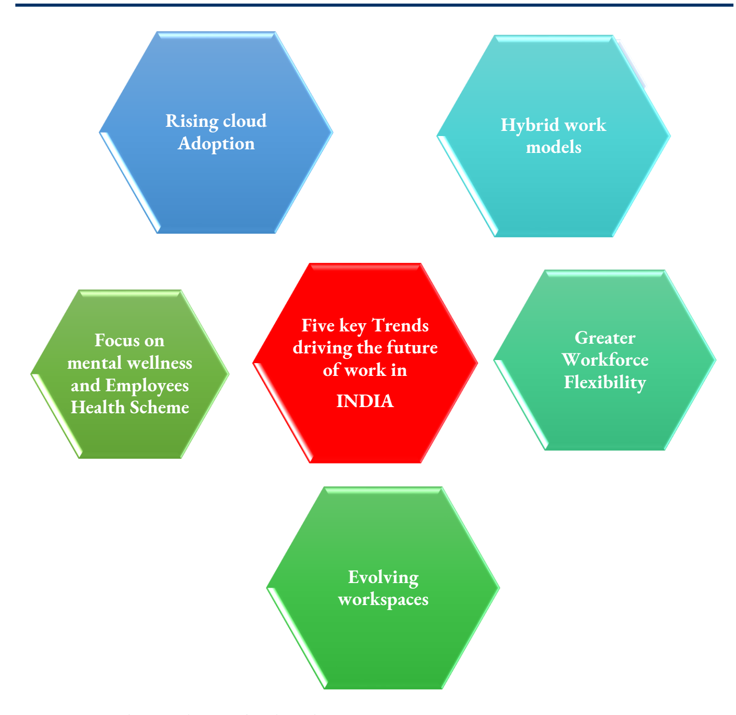
Figure 1: Key Trends Driving the Future of Work in India

Organization need Organizations must pressure test and review their IT security in light of the shifting workforce composition brought about by hybrid models and the growing digitization of business.