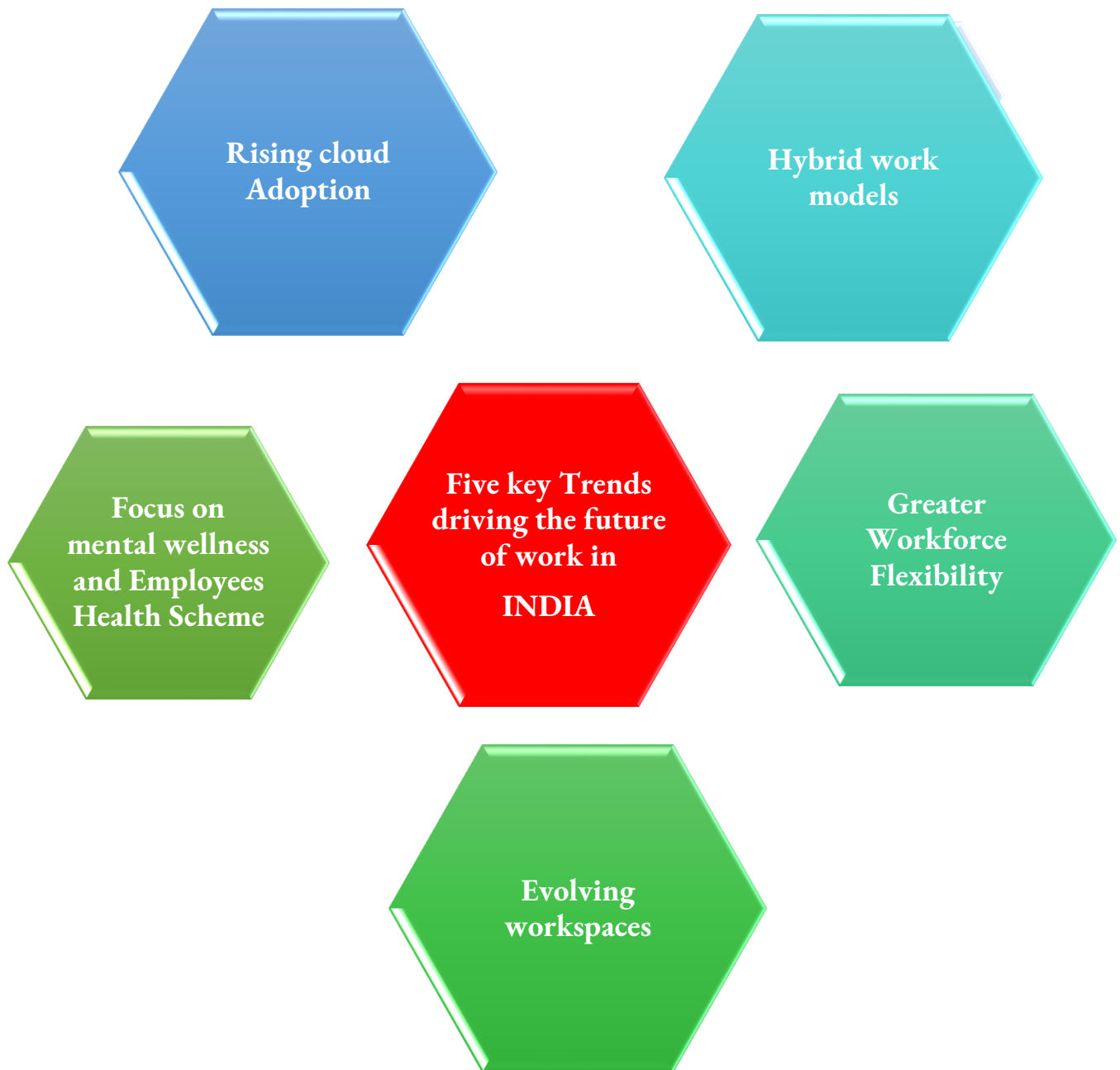
Figure 1: Key Trends Driving the Future of Work in India

Organization need Organizations must pressure test and review their IT security in light of the shifting workforce composition brought about by hybrid models and the growing digitization of business.